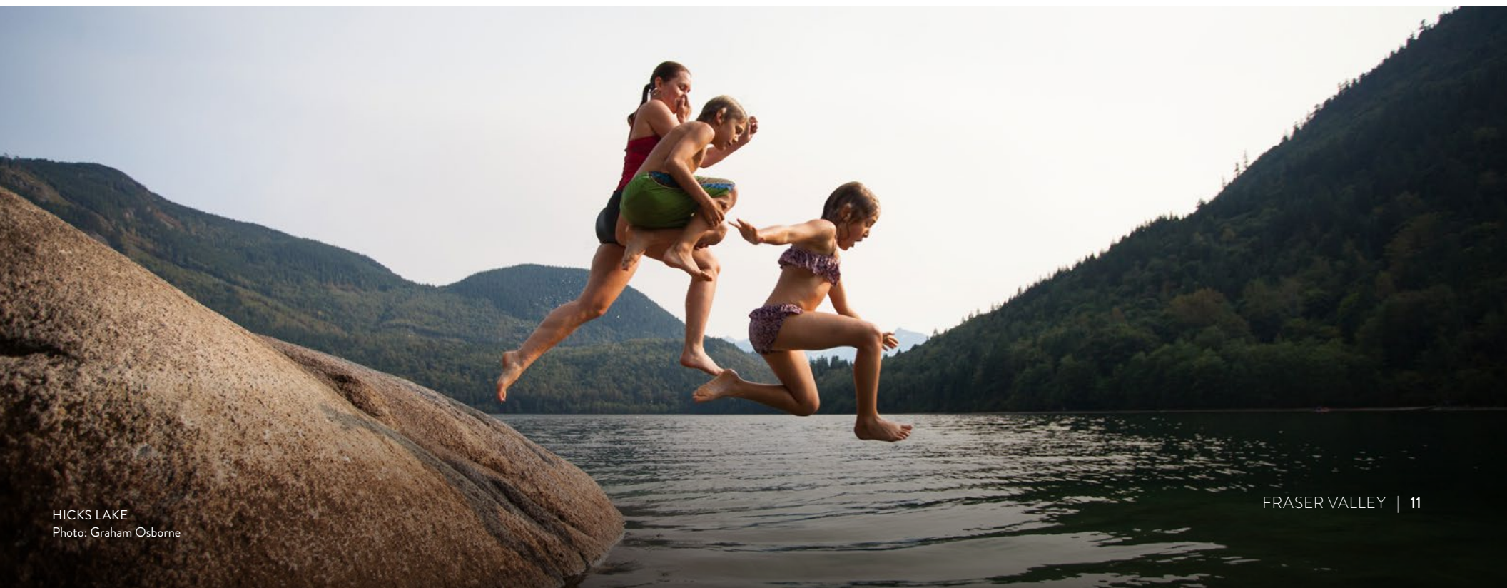
HICKS LAKE

FRONT COVER PHOTO: HARRISON LAKE