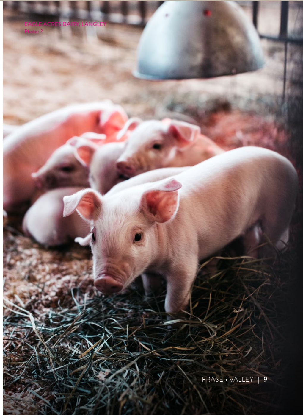
EAGLE ACRES DAIRY, LANGLEY Photo: ?